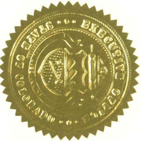
John Hickenlooper Governor

A handwritten signature in black ink that reads "John Hickenlooper".